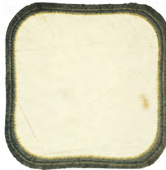
Cross Section at 100X

Microsquare means miniature square and rectangular, copper and aluminum magnet wire. Custom-produced by MWS in sizes smaller than 14 AWG or 3500 sq. mil. cross-sectional area, Microsquare is available in a wide range of solderable and high-temperature insulations and a variety of colors, with or without bondable overcoats. See pages 2 and 3 for information on film insulations and pages 8 and 9 for information on bondable overcoats. Microsquare magnet wire was developed to provide improved winding uniformity and maximum use of space.